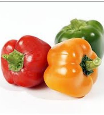
qīng jiāo 青椒