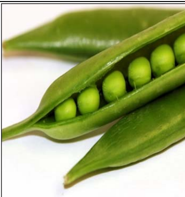
wān dòu 豌豆