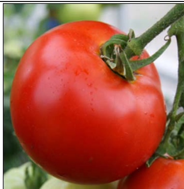
fān qié 番茄