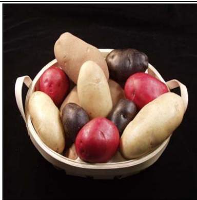
mǎ líng shǔ 马铃薯