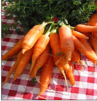
hú luó bo 胡萝卜