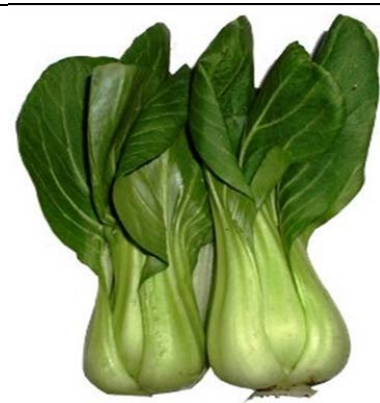
xiǎo bái cài 小白菜