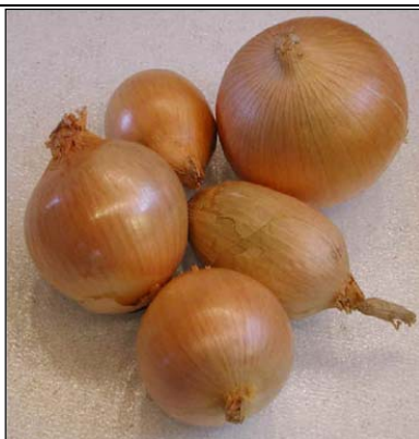
yáng cōng 洋葱